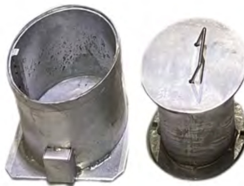
(Left) In Ground Sleeve & (Right) Cap once bollard has been removed

Height: 900mm Diameter: 114mm Wall thickness: 3.4mm Weight: 17kg Shape: Round