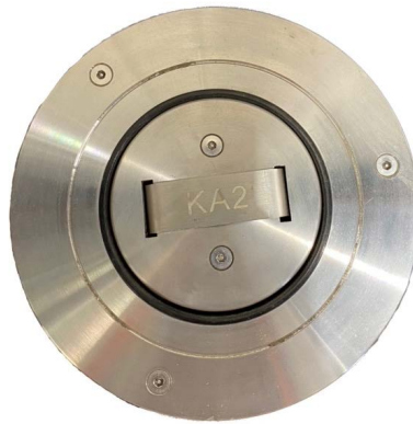
Birds eye view of the bollard when it is lowered into the ground.